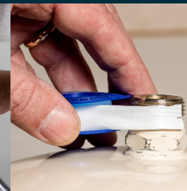
WATER HEATER PIPE WRAP